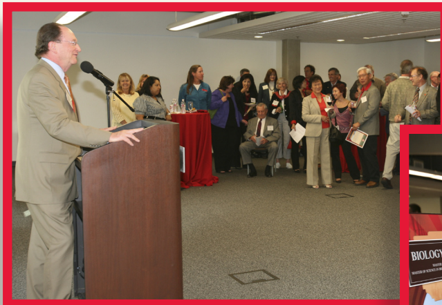
Campus and community members participate in the Celebration of Campus Excellence.