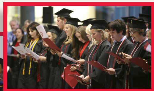
Faculty and students close the ceremony singing the alma mater.