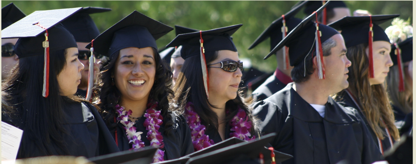
Over 640 students participated in Commencement 2008